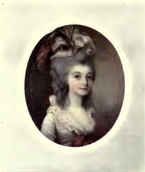
LADY MARY ELIZABETH NUGENT, AFTERWARDS MARCHIONESS OF BUCKINGHAM, AND IN HER OWN RIGHT, BARONESS NUGENT (OB. 1812) BY HORACE HONE